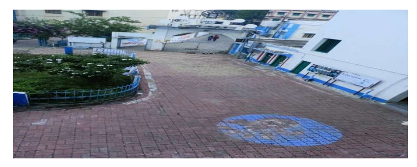
Pedestrian Friendly Pathways

College has pedestrian friendly pathways. Students & staffs enjoy comfort walking through the pedestrian friendly pathways within the campus.