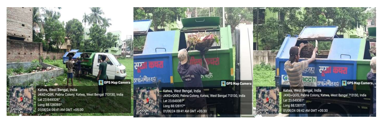
Waste (Bio-Degradable & Non-Bio Degradable) Management by the assistance of Katwa Municipality

Katwa Municipality provided field training on 'Solid Waste Management' to manage properly the solid wastes generated within the college campus to Ten(10)students of 3 units of NSS as a part of the programme under the MOU signed on 15.04.2023 between Katwa College and Katwa Municipality.