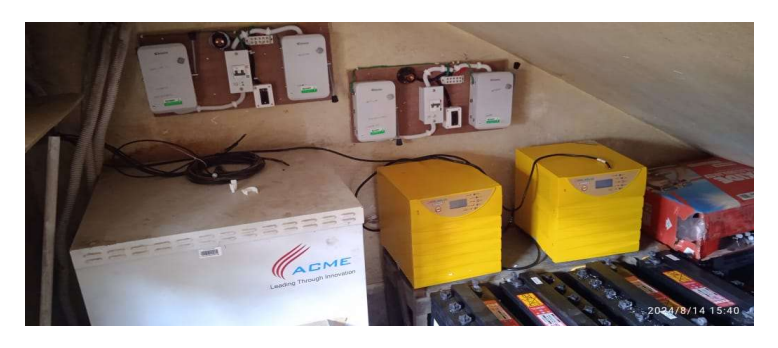
Wheeling to the Grid

Wheeling to the grid system has been recently installed for generation of enough electricity using sun-ray to meet the requirement of electricity of the college.