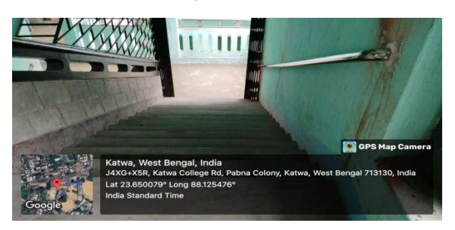
Installation of hand Railings in the staircases

Hand railings are fitted along the staircase to move easily.