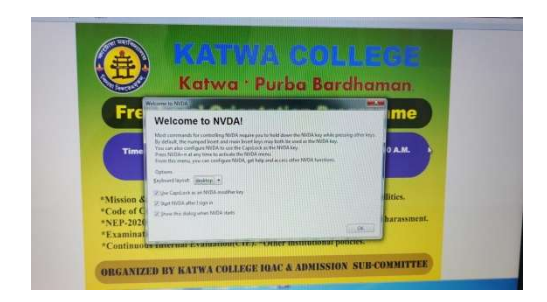
Non Visual Desktop Access (NVDA)

Screen reader is an assistive software programme which helps the visually impaired or the blind to work with computer. The Non Visual Desktop Access (NVDA) is free; open-source software. It is installed in the computers at B.ED dept. to help the visually challenged students in learning.