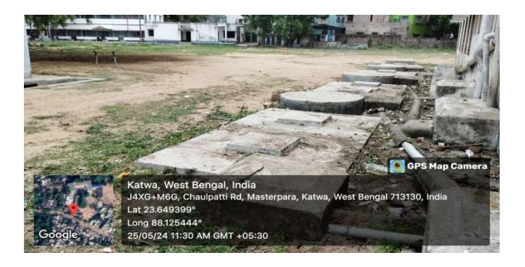
Waste water recycling through soak pit

The college has also made proper arrangement for recycling/ reuse of most of the waste water. Aqua guards placed in the different floors of the college building are purifying impure water stored in the rooftop water tanks & this water is used for drinking, washing, cleaning & watering in the garden.