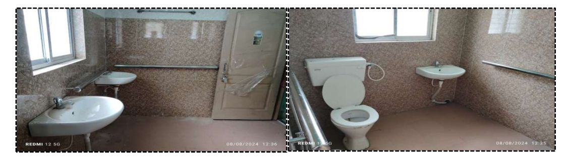
Disabled friendly Washrooms

College has set up disabled friendly washrooms for gents &ladies separately.